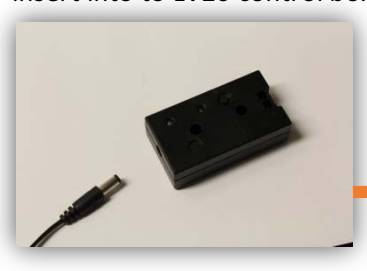
<u>Step 1.</u> Plug in power supply and insert into to LV20 control box.