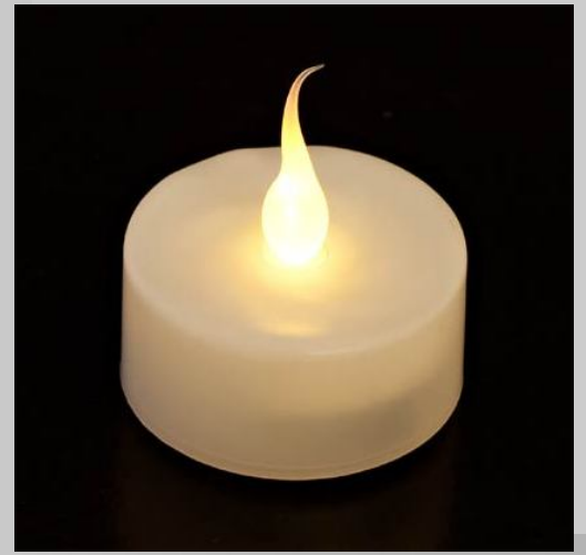
WARM WHITE FLAME

Amber LED Flame colour Or Warm White, The “Warm White” is a brighter